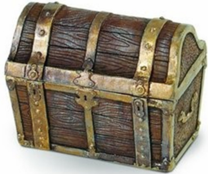
What's inside the mysterious box?