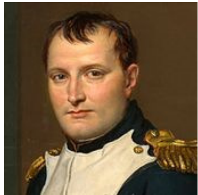
The Waterloo Protagonists— The Duke of Wellington and Napoleon Bonaparte